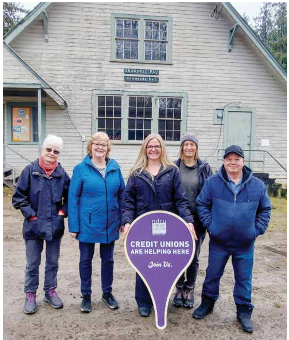
The local hall is the centre of every smaller community. That's why when the Crawford Bay & District Hall & Parks Association reached out to NDCU to support their significant restoration and retrofit of the Crawford Bay community hall, we knew this was a project we needed to support, making a $30,000 donation.

RSVP AGM@nelsoncu.com More meeting info at nelsoncu.com/AGM